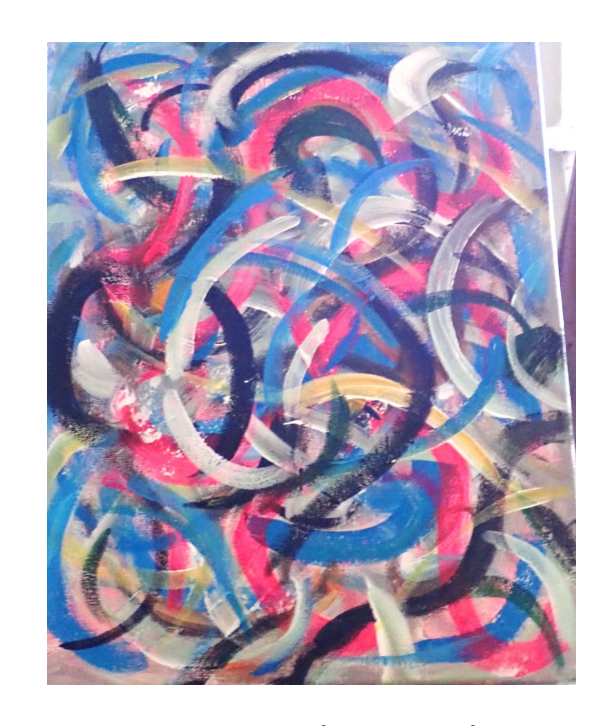
Painting #10 white swirls is abstract and 12 X 16 inches. $30

ChS Painting 10 $30 ChS Painting 11 $25 ChS Painting 12 $30