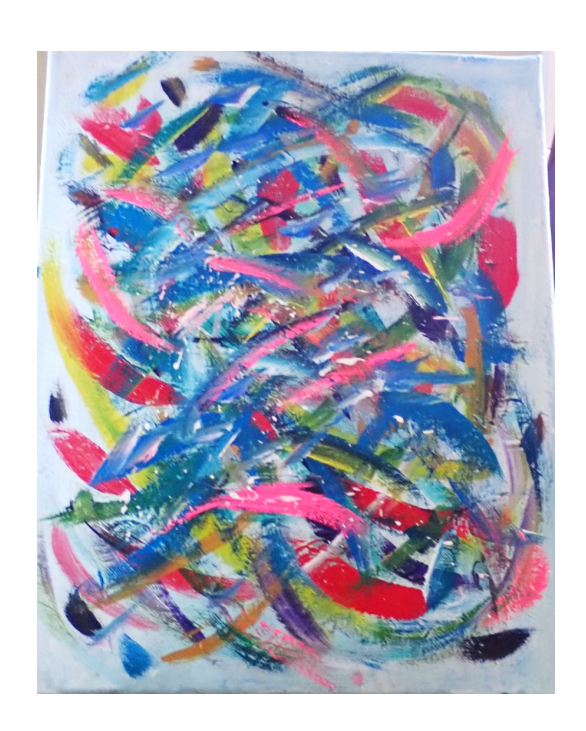
Painting #12 blue swirls is abstract and 12 X 16 inches. $30