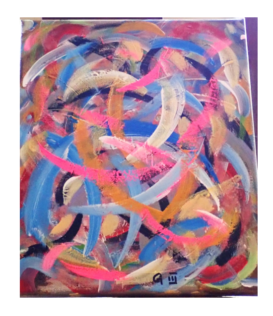
Painting #11 pink swirls is abstract and 11 X 14 inches. $25